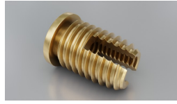
Type: ThreadH (headed)