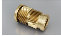
Type: SonicH (headed)