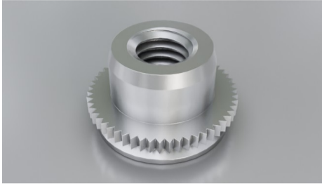
SF-FE or SF-FEO